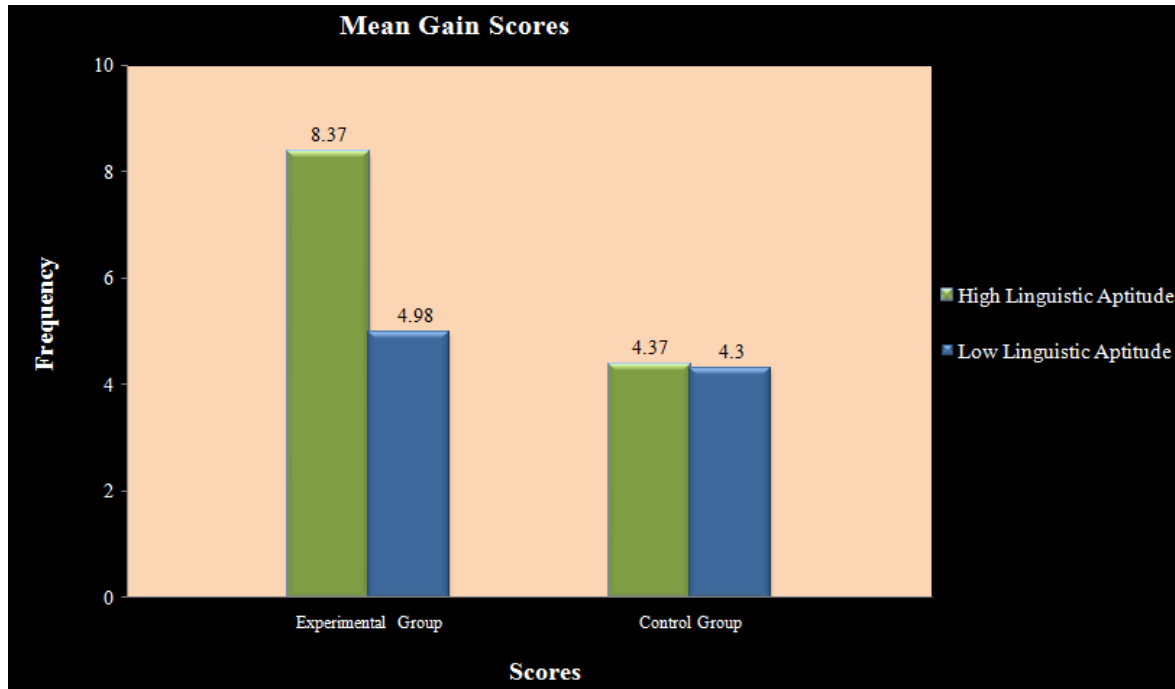
Fig-3: Bar diagram showing mean gain achievement scores for interaction effect of instructional strategies and English linguistic aptitude

Table-5 and fig-3 indicates that high English linguistic aptitude group with mean of 8.37 of experimental group exhibits high mean gain scores than that of low English linguistic aptitude group with mean 4.98 of experimental group. The t-ratio for difference in mean gain scores of high and low English linguistic aptitude of experimental group is 3.86 which in comparison to the table value was found significant at 0.01 levels of significance. The result indicates that the high English linguistic aptitude of experimental group exhibits high mean gain scores than that of low English linguistic aptitude of experimental group.